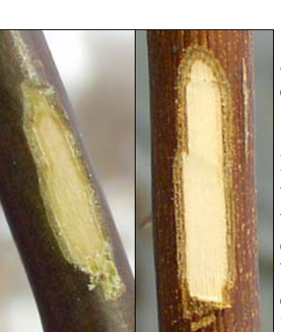
Live wood, at left, is moist and yellowish-green. Dead dark brown in color.

Apple trees will produce fruit even if they're never pruned. However, they'll bear larger, higher quality fruit more uniformly from year to year if trained properly when young and pruned every winter to maintain strong, vigorous limbs spaced evenly throughout an open canopy.