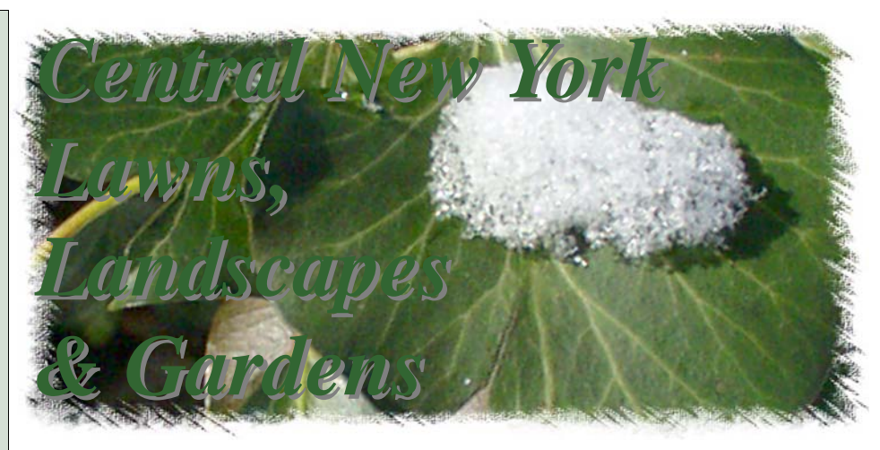
Volume 5 - Issue 1

Enjoy lilacs in your landscape from early May into July! . . . . . . and much more!